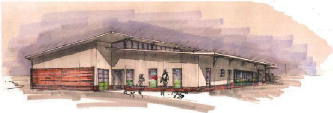
SCHEMATIC EXTERIOR SOUTHWEST VIEW